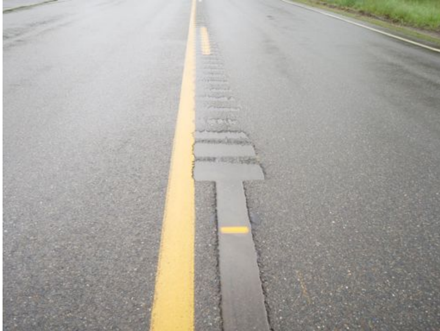
Figure 10: Typical milled-in pavement marker on SR 530 east of test.

On east end of the SR 530 test site current recessed RPM not visible/apparent in the rain etc and their subsurface mounting causes sight distances to be erratic and foreshortened.