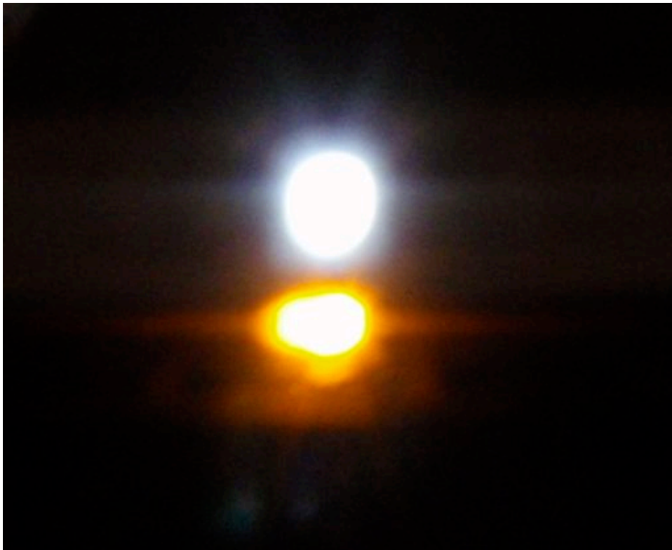
Figure 4;6: Astucia 1 candela white and amber stud conspicuity comparison

Passing Zones (broken line) 20'(curves) to 30' (6-9m) (single) 48' (single) 80' (single)