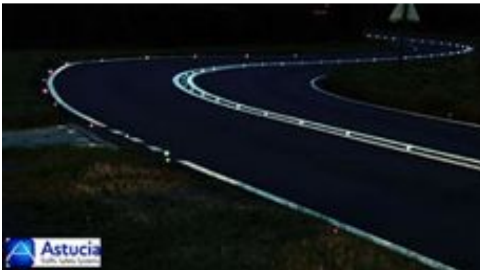
Figure 2: Astucia - clear guidance without distraction.

5. Conspicuity and pattern densities. In the UK Astucia set their luminance to 1 candela to provide clear guidance without distraction taking into consideration their pattern densities and spacing. Except for spacing guidance pattern same as WSDOT.