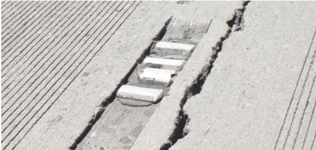
Figure 12: Caltrans – I5 Grapevine – effectiveness short lived

When clear of debris or water the reflective surfaces are short lived, site distances are foreshortened, and despite their subsurface mounting they're only viable during good weather and require frequent replacement.