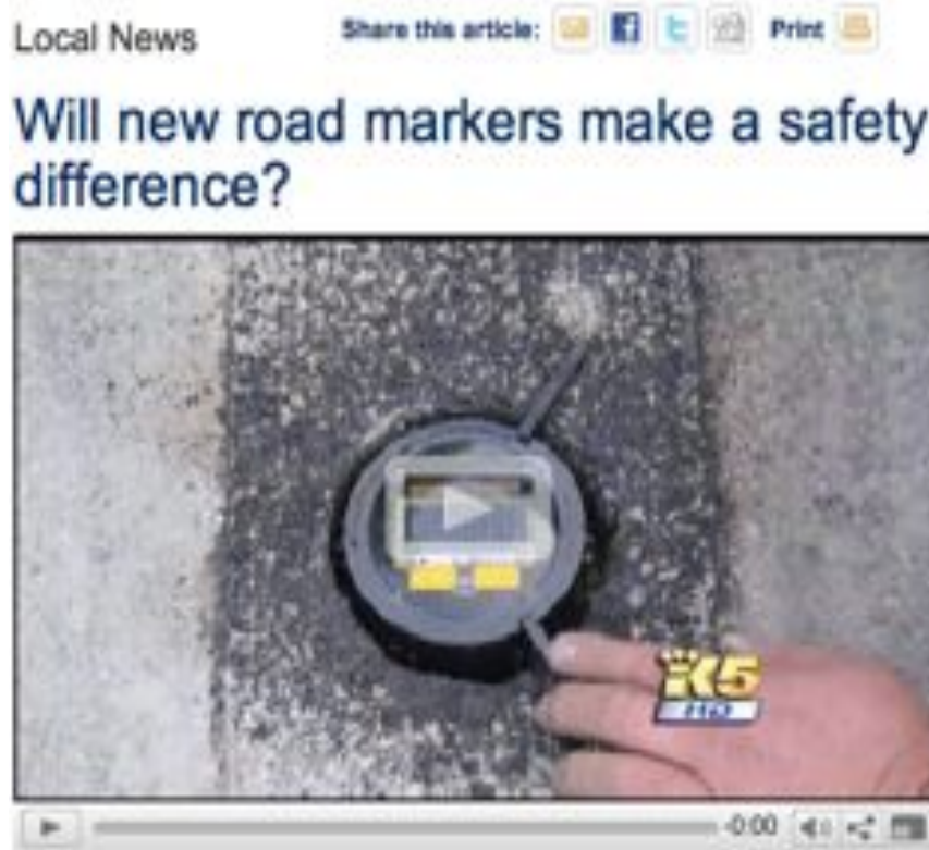
Figure 9: Link to Seattle King 5 News Coverage of installation 1

WSDOT solar stud press coverage, installation and site photos