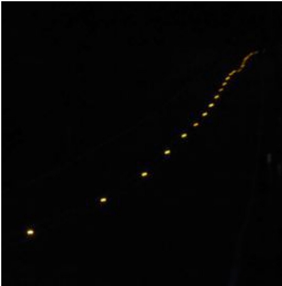
Figure 1: WSDOT - SR 530 – 900 plus feet of no passing zone with undulating terrain; Astucia flush studs milled-in subsurface on 40' centers

1 A single string of internally illuminated raised, flush or subsurface markers can successfully convey unique bi directional advanced guidance for passing and no passing exclusion zones as well as the nature of the changing terrain and curves ahead, illuminated studs only in Figure 1;