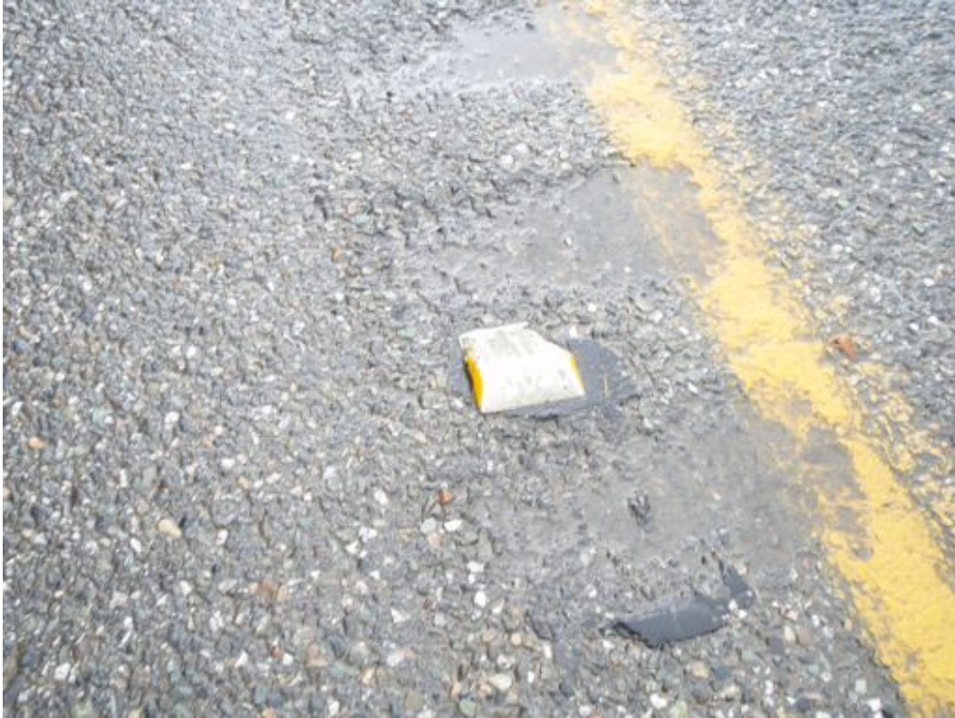
Figure 12: Typical 2 lane road missing markers and degradation

Dynamic loading and severe traffic mitigation - Regardless of dynamic loading, lateral forces on curves or wheel hop from the centerline rumble strips the Astucia stud's low profile design (.15 inch above; milled .125 below) is unaffected by these destructive forces. In heavy tire chain zones a .20 subsurface depth may be warranted.