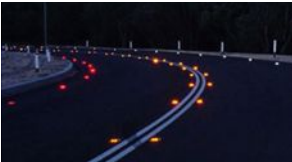
Figure 3: Brand X - too much luminance and distracting patterns.