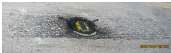
Figure 7: Milled-in Astucia flush stud

In this instance SR 530 is in a snow zone where steel snowplow bits may be used during extreme storms. Therefore we subsurface mounted the studs with 6mm deep milled slots to maintain sight distances.