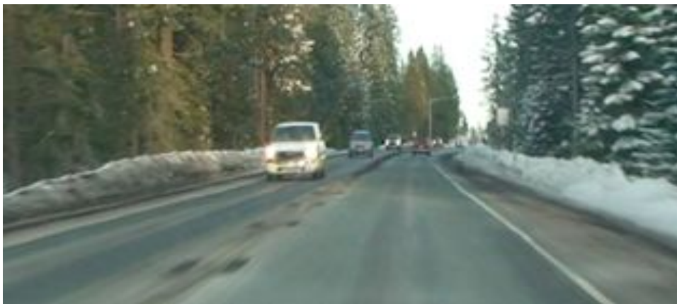
Figure 11: Caltrans – Highway 89 - studs covered for extended periods

Figure 11 is a debilitating debris example, the reflective surface of the stud is well below the road surface and it takes considerable time after a weather event to clear them - again ineffective when needed most.